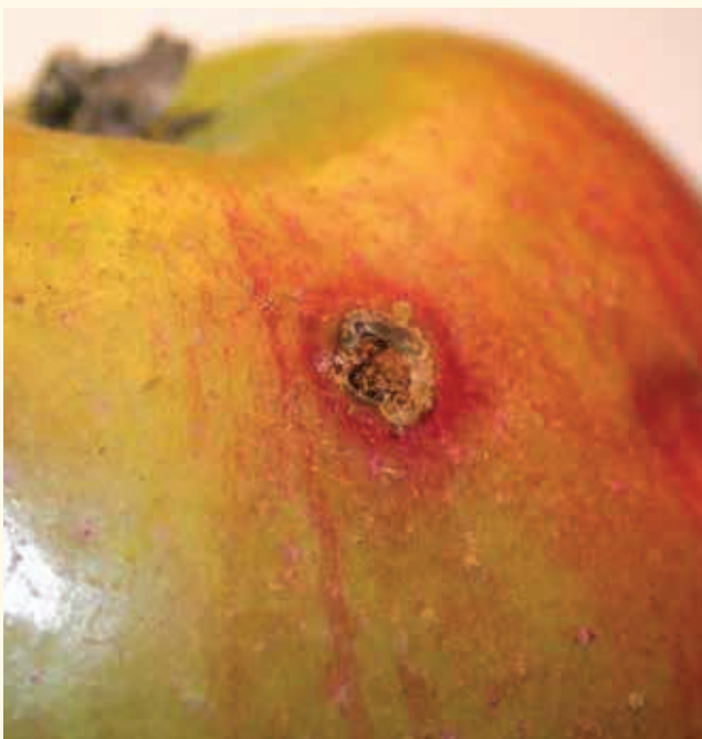
Above: Codling moth damage on apple – example of superficial damage.

Figures above: The graph above compares the percentage SUPERFICIAL and DEEP damage caused to apples by CM after application of various treatments. All treatments except the untreated had superficial damage. This is normal for virus products, because virus particles must be ingested before it becomes active. After activation the virus causes death of the CM larvae and limits deep damage. Note the difference between subsequent deep damage in the treated vs. untreated plots. The untreated control had no superficial damage but a high incidence of deep damage – this is because nothing prevented the larvae from causing deep damage. Madex® at all the rates provided significant reduction of deep damage caused by CM larvae. The Madex® program (100 ml up front and then 10 ml weekly) performed exceptionally well and was the best treatment overall.