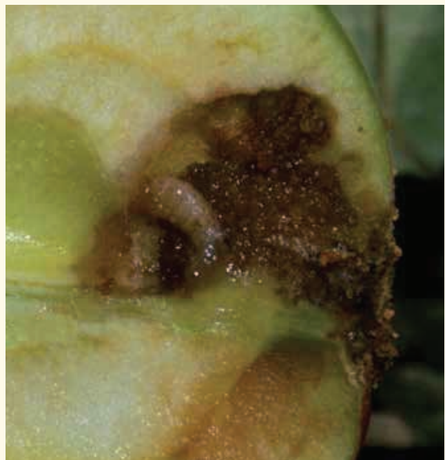
Above: Codling moth damage on apples – example of deep damage.